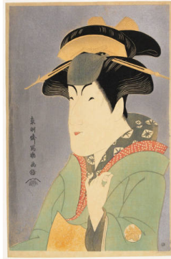
Title: Modern Reproduction of: Nakayama Tomisaburō as Miyagino Date: 20th century Primary Maker: Tōshūsai Sharaku Medium: Modern reproduction of a woodblock print; ink and color on paper