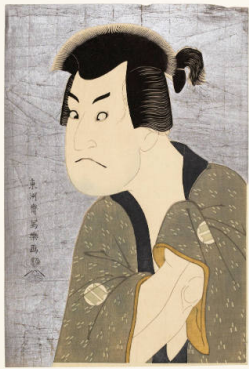
Title: Modern Reproduction of: Sakata Hangorō III as The Villian Fujikawa Mizuemon Date: 20th century Primary Maker: Tōshūsai Sharaku Medium: Modern reproduction of a woodblock print; ink and color on paper