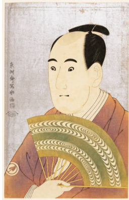
Title: Modern Reproduction of: Sawamura Sōjūrō III as Ōgishi Kurando Date: after 1928 Primary Maker: Tōshūsai Sharaku Medium: Modern reproduction of a woodblock print; ink and color on paper