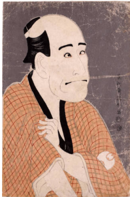
Title: Arashi Ryūzō in role of Moneylender, Ishibe Kinkichi Date: 1794 Primary Maker: Tōshūsai Sharaku Medium: Woodblock print (Nishiki-e); ink and color on paper, mica