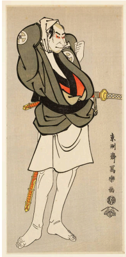
Title: Modern Reproduction of: Kabuki Actor Ōtani Oniji III Date: 20th century Primary Maker: Tōshūsai Sharaku Medium: Modern reproduction of a woodblock print; ink and color on paper