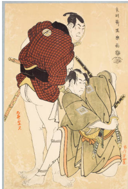
Title: Modern Reproduction of: Kabuki Actors Ichikawa Omezō as Tomita Hyōtarō and Ōtani Oniji III as Kawashima Jibugorō Date: 20th century Primary Maker: Tōshūsai Sharaku Medium: Modern reproduction of a woodblock print; ink and color on paper