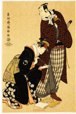
Title: Modern Reproduction of: Kabuki Actors Magoemon and Umegawa Date: 20th century Primary Maker: Tōshūsai Sharaku Medium: Modern reproduction of a woodblock print; ink and color on paper