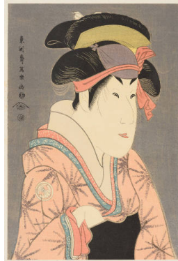
Title: Modern Reproduction of: Segawa Kikunojō Date: 1917-1918 Primary Maker: Tōshūsai Sharaku Medium: Modern reproduction of woodblock print; ink, color, and mica on paper