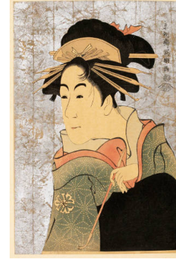
Title: Modern Reproduction of: Matsumoto Yonesaburō in the role of Courtesan Kewaizaka no Shōshō (Shinobu) in the Kabuki Performance "Katakiuchi Noriaibanashi" Date: 20th century Primary Maker: Tōshūsai Sharaku Medium: Modern reproduction of a woodblock print; ink and color on paper