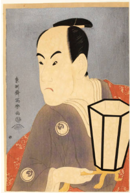
Title: Modern Reproduction of: Actor Bandō Hikosaburō III as Sagisaka Sanai Date: after 1906 Primary Maker: Tōshūsai Sharaku Medium: Modern reproduction of a woodblock print; ink and color on paper