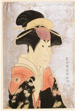
Title: Modern Reproduction of: Segawa Tomisaburō II as Yadorigi, Wife of Ōgishi Kurando Date: after 1928 Primary Maker: Tōshūsai Sharaku Medium: Modern reproduction of a woodblock print; ink and color on paper