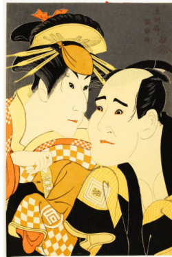
Title: Modern Reproduction of: Sanogawa Ichimatsu and Ichikawa Tomieimon Date: 20th century Primary Maker: Tōshūsai Sharaku Medium: Modern reproduction of woodblock print; ink and color on paper