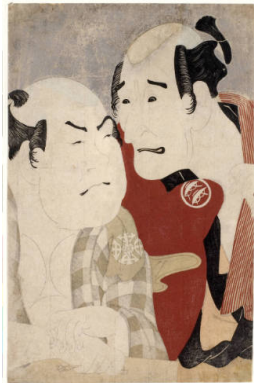
Title: The Actors Nakajima Wadaemon as Bōdara Chōzaemon and Nakamura Konozō as Gon, a Boatman, in the play "Katakiuchi Noriai Banashi" Date: 1794 Primary Maker: Tōshūsai Sharaku Medium: Woodblock print (Nishiki-e); ink and color on paper, mica