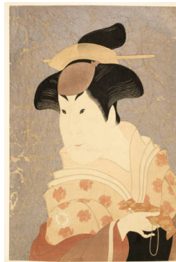
Title: Modern Reproduction of: Iwai Hanshirō IV as the Wet Nurse Shigeno Date: 20th century Primary Maker: Tōshūsai Sharaku Medium: Modern reproduction of a woodblock print; ink and color on paper