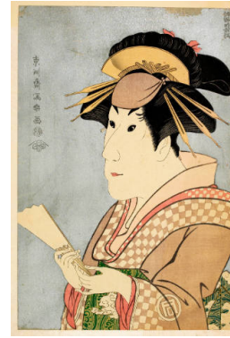
Title: Modern Reproduction of: Sanokawa Ichimatsu III as the Gion Prostitute Onayo Date: 20th century Primary Maker: Tōshūsai Sharaku Medium: Modern reproduction of a woodblock print; ink and color on paper