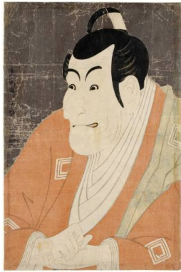
Title: Ichikawa Ebizō as Takemura Sadanoshin in the play, Koi-Nyōbō Somewake Tazuna Date: 1794 Primary Maker: Tōshūsai Sharaku Medium: Woodblock print; ink, color, and mica on paper