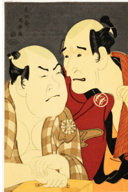
Title: Modern Reproduction of: Kabuki Actors Nakajima Wadaemon as Bōdara Chōzaemon and Nakamura Konozō as Gon of the Kanagawaya Date: 20th century Primary Maker: Tōshūsai Sharaku Medium: Modern reproduction of a woodblock print; ink and color on paper