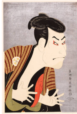
Title: Modern Reproduction of: Kabuki Actor Ōtani Oniji III as Edohei Date: 1956 Primary Maker: Tōshūsai Sharaku Medium: Modern reproduction of a woodblock print; ink and color on paper