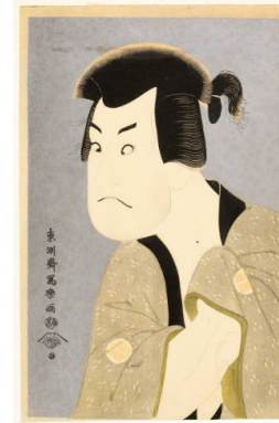
Title: Modern Reproduction of: Sakata Hangorō III as Fujikawa Mizuemon Date: after 1906 Primary Maker: Tōshūsai Sharaku Medium: Modern reproduction of a woodblock print; ink and color on paper