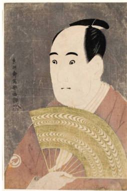
Title: The Actor Sawamura Sōjūrō III as Ōgishi Kurando Date: 1794 Primary Maker: Tōshūsai Sharaku Medium: Ink, color and mica on paper Technique: Nishiki-e (Woodblock print with color blocks)