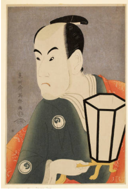
Title: Modern Reproduction of: Kabuki Actor Bandō Hikosaburō III Date: 20th century Primary Maker: Tōshūsai Sharaku Medium: Modern reproduction of a woodblock print; ink and color on paper