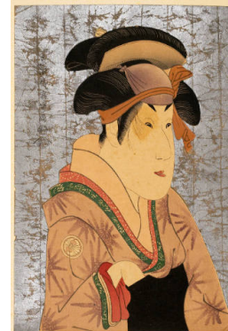
Title: Modern Reproduction of: Segawa Kikunojō III as Oshizu, Wife of Tanabe Bunzō Date: 20th century Primary Maker: Tōshūsai Sharaku Medium: Modern reproduction of a woodblock print; ink and color on paper