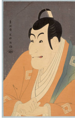
Title: Modern Reproduction of: Kabuki Actor Ichikawa Ebizō as Takemura Sadanoshin Date: 20th century Primary Maker: Tōshūsai Sharaku Medium: Modern reproduction of a woodblock print; ink and color on paper