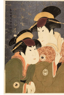
Title: Modern Reproduction of: Kabuki Actors Segawa Tomisaburō II and Nakamura Manyo Date: 20th century Primary Maker: Tōshūsai Sharaku Medium: Modern reproduction of a woodblock print; ink and color on paper