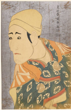
Title: Modern Reproduction of: Morita Kan'ya VIII as the Palanquin-bearer Uguisu no Jirōsaku Date: 20th century Primary Maker: Tōshūsai Sharaku Medium: Modern reproduction of a woodblock print; ink and color on paper