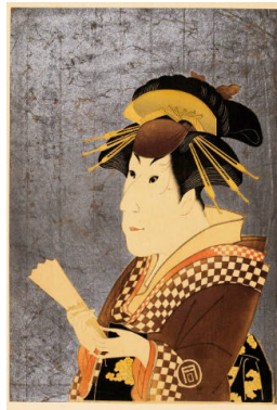
Title: Modern Reproduction of: Sanokawa Ichimatsu III as the Gion Prostitute Onayo Date: 20th century Primary Maker: Tōshūsai Sharaku Medium: Modern reproduction of a woodblock print; ink and color on paper