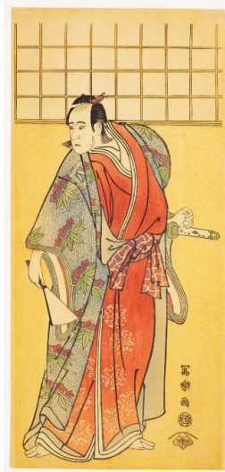
Title: Modern Reproduction of: The Kabuki Actor Ichikawa Yazoō III Date: 20th century Primary Maker: Tōshūsai Sharaku Medium: Modern reproduction of a woodblock print; ink and color on paper