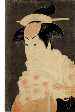
Title: The Onnagata Actor Iwai Hanshirō Date: 1794 Primary Maker: Tōshūsai Sharaku Medium: Woodblock print (Nishiki-e); ink and color on paper, mica