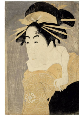
Title: Matsumoto Yonesaburō in the role of Courtesan Kewaizaka no Shōshō (Shinobu) Date: 1794 Primary Maker: Tōshūsai Sharaku Medium: Woodblock print (Nishiki-e); ink and color on paper, mica