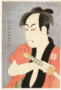
Title: Modern Reproduction of: Ichikawa Omezō I as the Footman (Yakko) Ippei Date: after 1928 Primary Maker: Tōshūsai Sharaku Medium: Modern reproduction of a woodblock print; ink and color on paper