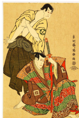
Title: Modern Reproduction of: Kabuki Actors Ichikawa Yaozō III as Fuwa Banzaemon and Sakata Hangorō III as Kosodate Kannonbō Date: 20th century Primary Maker: Tōshūsai Sharaku Medium: Modern reproduction of a woodblock print; ink and color on paper