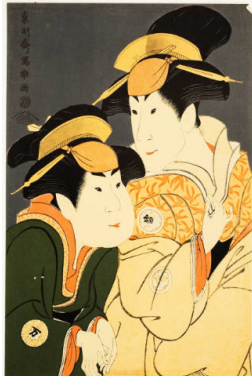
Title: Modern Reproduction of: Kabuki Actors Segawa Tomisaburō II as Yadorigi, Wife of Ōgishi Kurando, and Nakamura Man'yo as the Maid Wakakusa Date: 20th century Primary Maker: Tōshūsai Sharaku Medium: Modern reproduction of a woodblock print; ink and color on paper