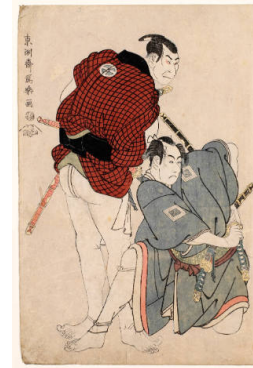
Title: The Actors Ichikawa Omezō I as Sekitori Ikazuchi and Ōtani Oniji II as Ukiyo Tsuchihei in the Play Nihon-Matsu Michinoku Sodachi Date: 1794 Primary Maker: Tōshūsai Sharaku Medium: Woodblock print (Nishiki-e); ink and color on paper, mica