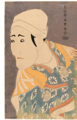
Title: Modern Reproduction of: Kabuki actor Morita Kanaya VIII in a Kabuki play presented in the 5th month of 1794 Date: 20th century Primary Maker: Tōshūsai Sharaku Medium: Modern reproduction of a woodblock print; ink and color on paper