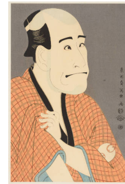
Title: Modern Reproduction of: Kabuki Actor Arashi Ryūzō Date: 1917-1918 Primary Maker: Tōshūsai Sharaku Medium: Modern reproduction of woodblock print; ink, color, and mica on paper