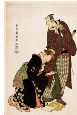
Title: Modern Reproduction of: Kabuki Actors Magoemon and Umegawa Date: 20th century Primary Maker: Tōshūsai Sharaku Medium: Modern reproduction of a woodblock print; ink and color on paper