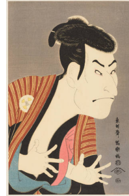
Title: Modern Reproduction of: Kabuki Actor Ōtani Oniji Date: 1917-1918 Primary Maker: Tōshūsai Sharaku Medium: Modern reproduction of woodblock print; ink, color, and mica on paper