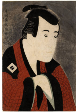
Title: Ichikawa Yaozō III in the role of Tanabe Bunzō Date: 1794 Primary Maker: Tōshūsai Sharaku Medium: nishiki-e (Color woodblock print) Technique: Nishiki-e (Woodblock print with color blocks), mica