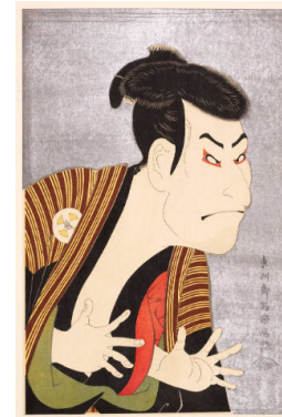
Title: Modern Reproduction of: Kabuki Actor Ōtani Oniji III as Edohei Date: 1955 Primary Maker: Tōshūsai Sharaku Medium: Modern reproduction of a woodblock print; ink and color on paper