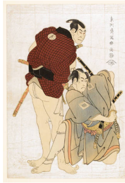
Title: Modern Reproduction of: Ichikawa Omezō I as Tomita Hyōtarō and Ōtani Oniji III as Kawashima Jibugorō Date: after 1928 Primary Maker: Tōshūsai Sharaku Medium: Modern reproduction of a woodblock print; ink and color on paper