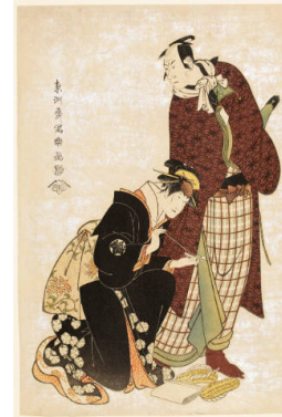
Title: Modern Reproduction of: Actors Matsumoto Kōshirō IV as Magoemon and Nakayama Tomisaburō I as Umegawa in the Kabuki Performance "Yomo no Nishiki Kōkyō no Tabiji" Date: after 1928 Primary Maker: Tōshūsai Sharaku Medium: Modern reproduction of a woodblock print; ink and color on paper