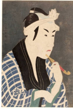
Title: Modern Reproduction of: Matsumoto Kōshirō IV as Gorōbei, the Fishmonger from San'ya Date: 20th century Primary Maker: Tōshūsai Sharaku Medium: Modern reproduction of a woodblock print; ink and color on paper