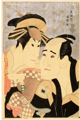
Title: Modern Reproduction of: Sanogawa Ichimatsu III in the role of the courtesan Onnayo of Gion and Ichikawa Tomieimon in the role of Kanisaka Tōma Date: 20th century Primary Maker: Tōshūsai Sharaku Medium: Modern reproduction of a woodblock print; ink and color on paper