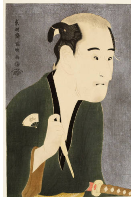
Title: Modern Reproduction of: Kabuki Actor Onoe Matsusuke Date: 20th century Primary Maker: Tōshūsai Sharaku Medium: Modern reproduction of a woodblock print; ink and color on paper