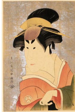
Title: Modern Reproduction of: Actor Osagawa Tsuneyo II Date: 20th century Primary Maker: Tōshūsai Sharaku Medium: Modern reproduction of a woodblock print; ink and color on paper