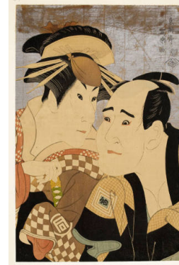
Title: Modern Reproduction of: Sanogawa Ichimatsu III as courtesan Onayo of Gion and Ichikawa Tomieimon as Kanisaka Tōma Date: 20th century Primary Maker: Tōshūsai Sharaku Medium: Modern reproduction of a woodblock print; ink and color on paper