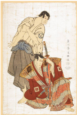
Title: Modern Reproduction of: Ichikawa Yaozō III as Fuwa no Banzaemon and Sakata Hangorō III as Kosodate no Kannonbo Date: 20th century Primary Maker: Tōshūsai Sharaku Medium: Modern reproduction of a woodblock print; ink and color on paper