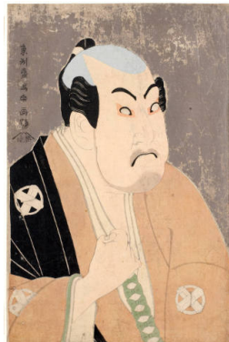
Title: Tanimura Torazō as Washizuka Hachiheiji Date: 1794 Primary Maker: Tōshūsai Sharaku Medium: Woodblock print (Nishiki-e); ink and color on paper, mica