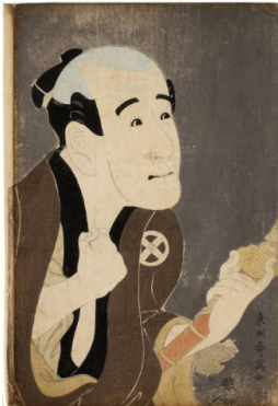
Title: Ōtani Tokuji as a servant, Sodesuke Date: 1794 Primary Maker: Tōshūsai Sharaku Medium: nishiki-e on mica ground Technique: Nishiki- e (Woodblock print with color blocks), mica