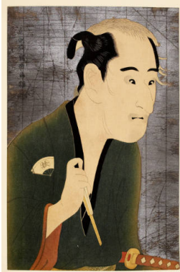
Title: Modern Reproduction of: Kabuki Actor Onoe Matsusuke Date: 20th century Primary Maker: Tōshūsai Sharaku Medium: Modern reproduction of a woodblock print; ink and color on paper