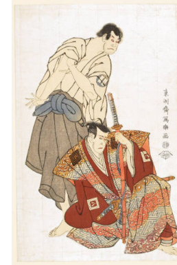
Title: Modern Reproduction of: Ichikawa Yaozō III as Fuwa Banzaemon and Sakata Hangorō III as Kosodate Kannonbō Date: after 1928 Primary Maker: Tōshūsai Sharaku Medium: Modern reproduction of a woodblock print; ink and color on paper