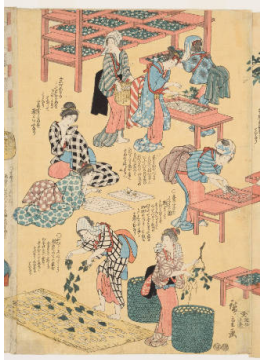
Title: Women Performing Tasks in Silk Cloth Production Date: c. 1847 - 1852 Primary Maker: Utagawa Hiroshige Medium: Woodblock print (Nishiki-e); ink and color on paper